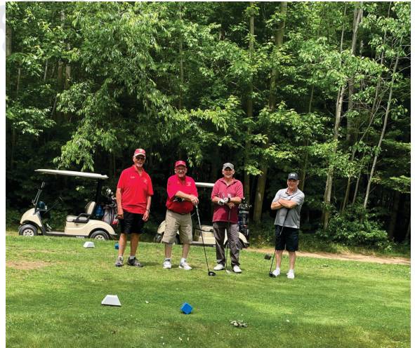
June 2025 Golf Tournament