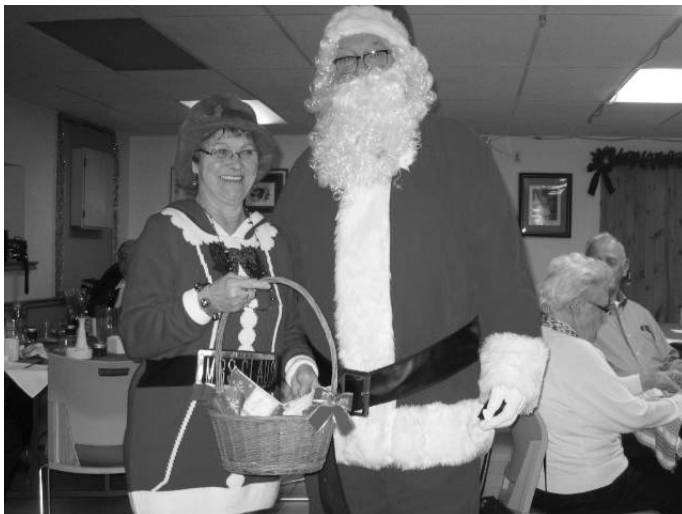
"Santa and his elf making their visit to the Algonquin Shrine Club meeting in December"