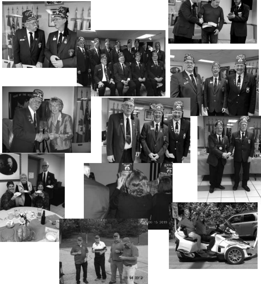
Photo Highlights from 2019