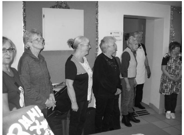
The fantastic ladies and men of the Wilberforce Legion who provide our great meals, Thanks again !!